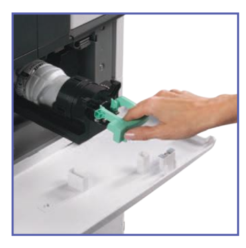
High-yield consumables help minimize operating costs and downtime. Genuine Ricoh supplies foster optimal performance and superior print quality.