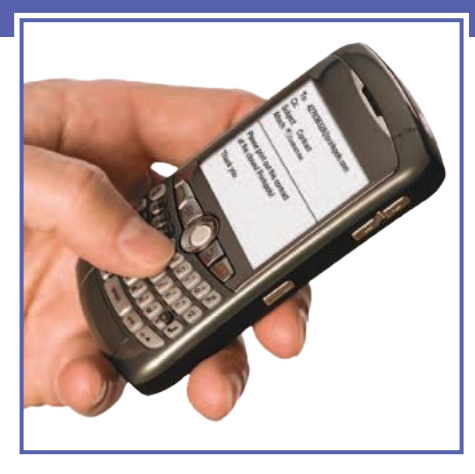
Print from mobile devices to HotSpotenabled MFPs and printers for fast, convenient printing on the go.